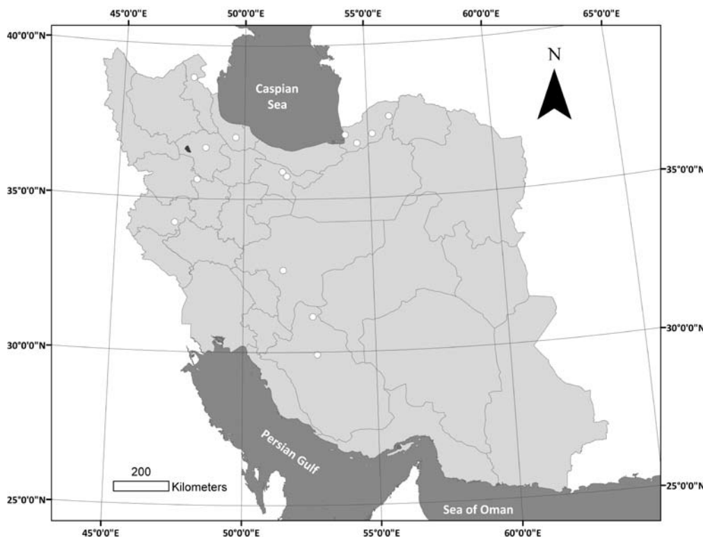
Fig. 1. Iran, showing location of Anguran Wildlife Refuge (black polygon) and confirmed records of the European Badger Meles meles (white dots) by Etemad (1985).

The total sampling effort from the beginning of the study until July 2010 was 510 camera-trap nights. The picture of the European Badger was obtained in late July 2010 at 04h00 (Fig.