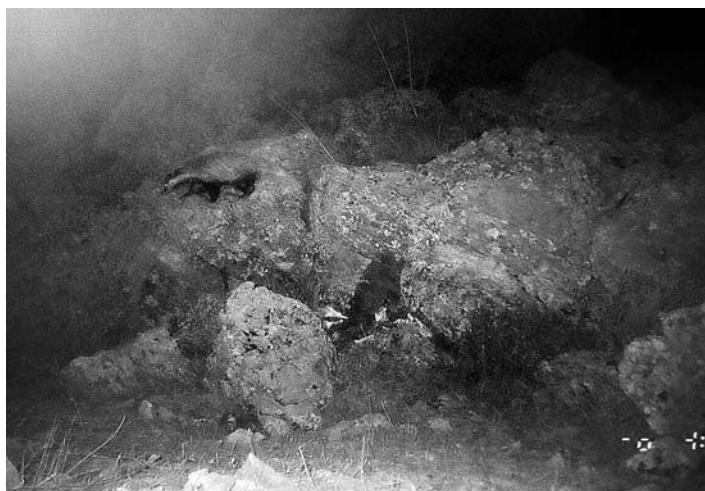
Fig. 2. Camera-trap picture of the European Badger Meles meles at Anguran Wildlife Refuge, Iran, July 2010.

Like other members of Mustelidae, the European Badger is