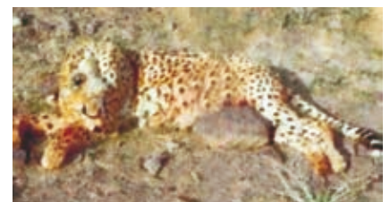
Fig. 2. Cheetah poached in the late 1990s (Photo H. Akbari).

Once distributed across most desert habitats of eastern Iran, the Asiatic chee-