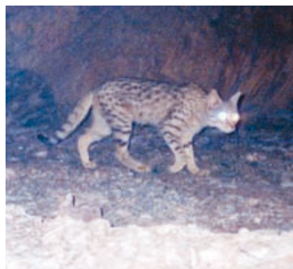
Fig. 7. Wild cat captured by camera trap on 7 August 2007 (Photo Iranian Cheetah Society /Esfahan University of Technology).

The wild cat is one of the most abundant felids in Iran with a wide range of distribution throughout the country (Ziaie 1996). However, the animal is not regularly seen in the area of the survey. Results of camera-trapping efforts have confirmed wild cat depredation on small livestock in villages in the area (Fig. 7).