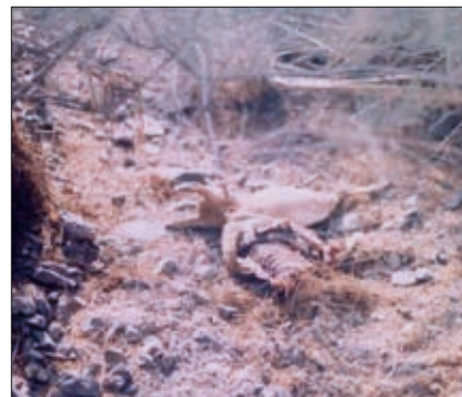
Fig. 3. A young wild goat killed and hidden under a tamarisk as a specific leopard habit in August 2005.

most of the central rocky mountainous terrain where access is difficult. Most of the leopards' kills found in the area were wild goats (Fig. 4), which reflects the greater abundance of the latter species than that of wild sheep, as well as the greater overlap of the goats' range with that of the leopards (Farhadinia et al. 2006). However, remains of wild sheep were also occasionally found, and scat analysis revealed that leopards sometimes consume small mammals, including rodents, as well. Local people sometimes reported leopard attacks on domestic camels and livestock, usually in the foothills. It is roughly estimated that 5 – 10 leopards live throughout Abbasabad.