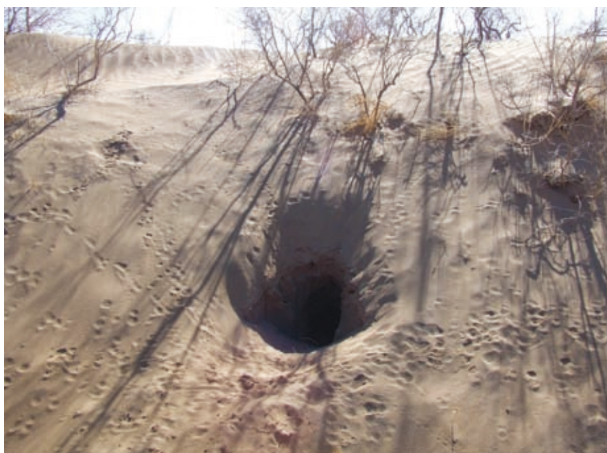
Fig. 6. Sand cat den among sand dunes (Photo H. Akbari).

Out of eight felid species in Iran, five occur in Abbasabad Reserve, one of the highest diversities of cat species in Esfahan Province. This area is the only