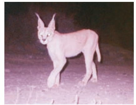
Fig 4. An adult caracal captured by camera trap on 16 July 2007

Little is known about various aspects of the ecology of the caracal in Iran despite its wide distribution throughout the eastern half of the country. Abbasabad is supposed to be one of the best habitats for the species in the country, and it seems that the animal has the highest abundance of all cat species in the area (Farhadinia et al. 2007). The caracal is well known among local people who give it names such as black-eared cat,