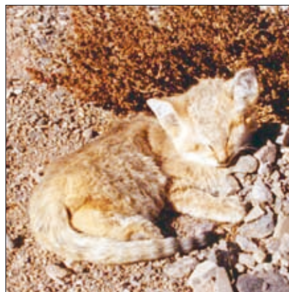
Fig. 5. A female sand cat found dead in Abbasabad in November 2004.

Abbasabad before 2004 when a dead sand cat was found in the western area (Figs 5 and 6). So far five patches of the species' distribution have been explored mainly consisting of sandy plains with abundant saxaul trees. Because of