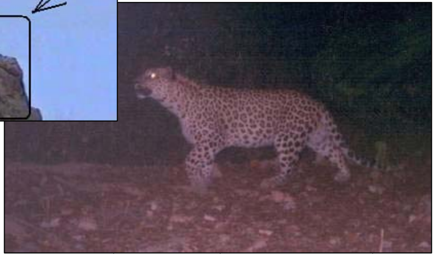
( ) ( )