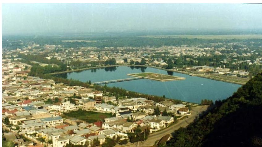
Figure 1. A view of Lahijan Pond.

Observations also show that the diversity of waterbirds present at the site increased during the past decade. However all the waterbirds observed are migrants wintering on the southern plains of the Caspian Sea. No waterbirds were observed during June to September 2006. It is important to discover whether passage migrants around this pond remain (as non-breeders) in spring and summer.